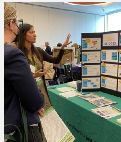
BRIDGES CPT members at the annual C3 (Chicago Consortium for Community Engagement) conference and Illinois Children's Healthcare Foundation meeting